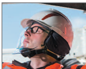
4 point chinstrap as standard, chin cup is optional