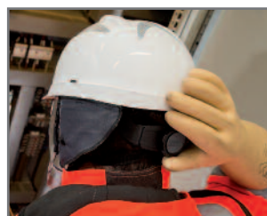
FasTrac III comfort pad & handy ratchet