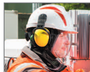
Optional arc flash liner can be worn below