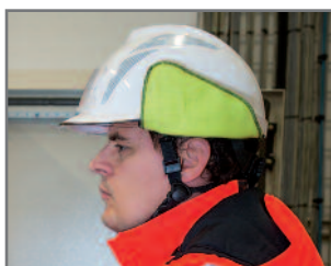
Visor up and ear flaps up